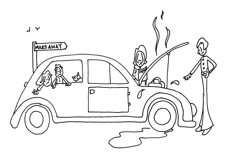
Chapter 1 • Is that a light at the end of my tunnel?

Let me explain. If you took the most basic electronic calculator and took it apart, have a look at all the electronics in there and try to tell me how it works .... Like me, you'd have no idea. But it doesn't matter, because we don't need to know how it does what it does, we just need to know that when we hit the number "1" button, followed by the "+" button, and then the "1" button again followed by the "=" button, it will add these two numbers together and give us an answer ... simple.